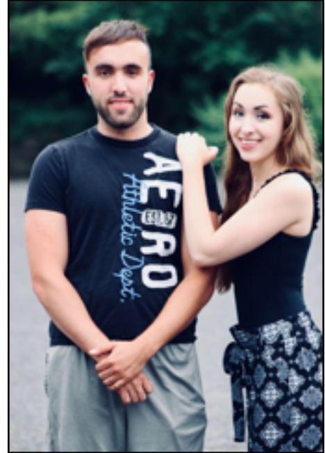
The twins today

May we all have that same courage in whatever challenge God puts before us.