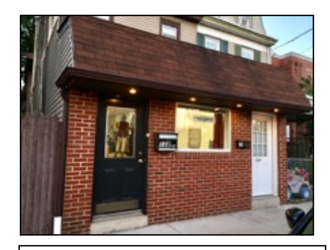
Helpers Academy, located at 138 Broadway in Gloucester City, is a storefront, easily accessible, new pro-life resource center.