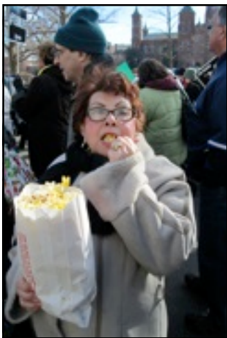
A little popcorn for mid-march nourishment.