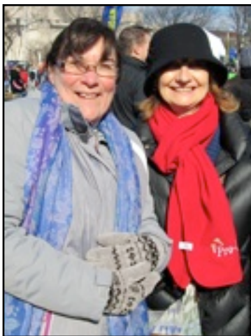
Cold? Who's cold?!