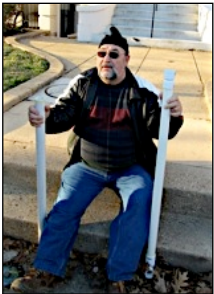
"Can I ski back to the bus?"