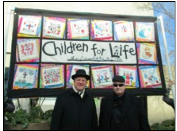
For a brief period, our Children's Pro-Life banner flew high, until gusty winds threatened to take it, and its carriers, airborne!