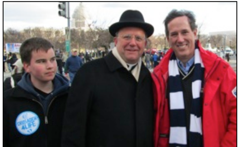
A familiar friend warmly greets our group, Senator Rick Santorum.