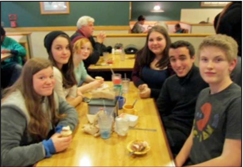
Warm, at last!