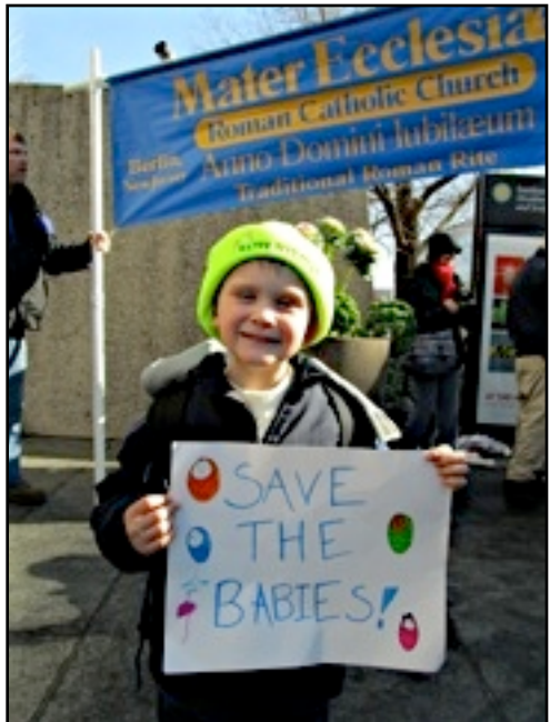
Here's someone who "bearly" felt the cold.