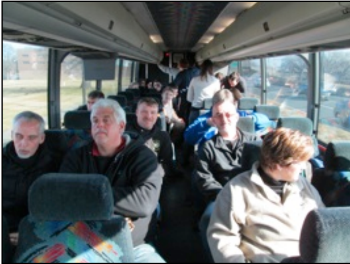
A cold, but sunny, start to the day.