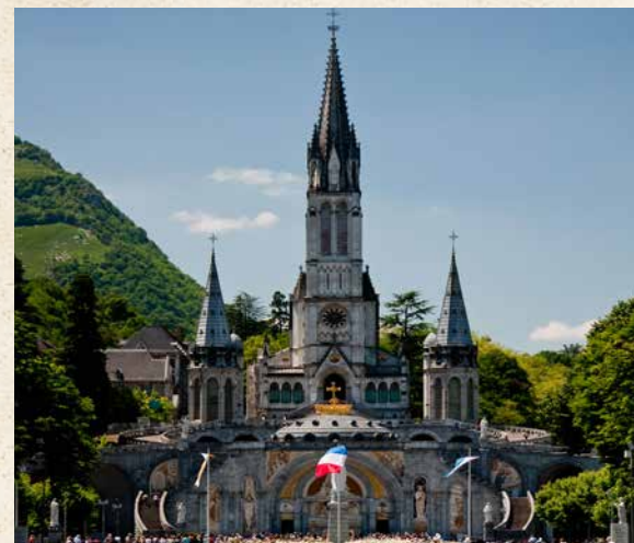
BASILICA OF OUR LADY OF THE ROSARY OF LOURDES

Depart Zaragoza to Avila, the city of Kings and of Saints, which is completely encircled