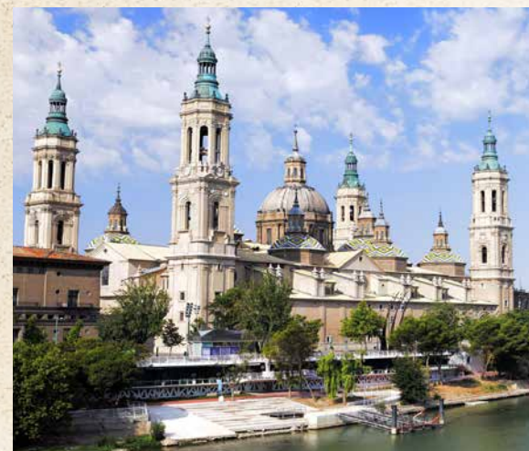
BASILICA OF OUR LADY OF THE PILLAR - ZARAGOZA

Transfer to the airport for your flights back to Newark.