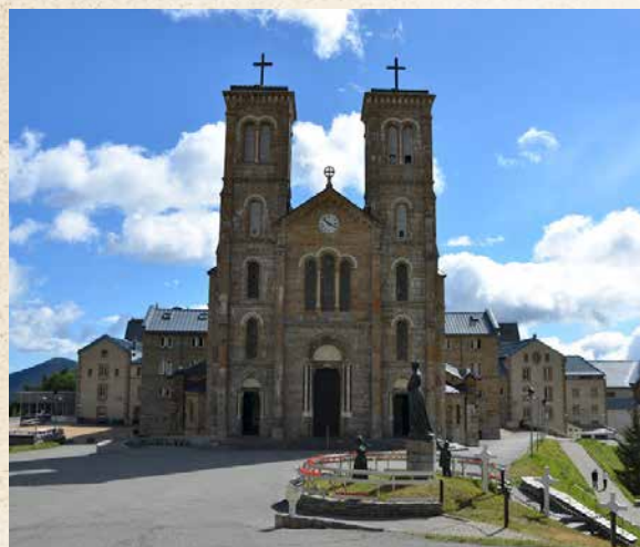
SHRINE OF OUR LADY OF LA SALETTE

Today travel to Nevers to visit the convent of St. Gildard, where St. Bernadette's incorrupt body reposes and may be viewed, and have Mass. After she was blessed with eighteen apparitions of the Virgin Mary in Lourdes St. Bernadette retired to Nevers. She received the religious habit in 1866. On to Ars for dinner and overnight.