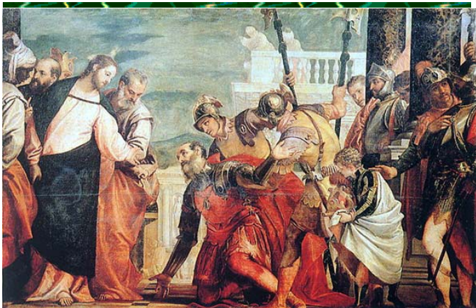
Jesus and the Centurion

A nd when He had entered into Capharnaum, there came to Him a centurion beseeching Him, and saying, Lord, my servant lieth at home sick of the palsy, and is grievously tormented. And Jesus saith to him, I will come and heal him. And the centurion making answer, said, Lord, I am not worthy that Thou shouldst enter under my roof: but only say the word, and my servant shall be healed.