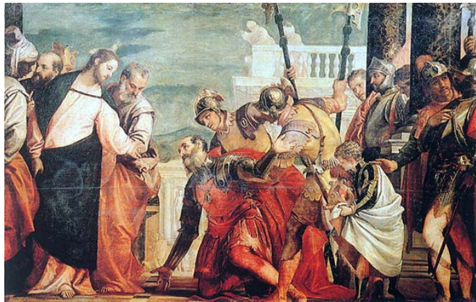
Jesus and the Centurion

A nd when He had entered into Capharnaum, there came to Him a centurion beseeching Him, and saying, Lord, my servant lieth at home sick of the palsy, and is grievously tormented. And Jesus saith to him, I will come and heal him. And the centurion making answer, said, Lord, I am not worthy that Thou shouldst enter under my roof: but only say the word, and my servant shall be healed.